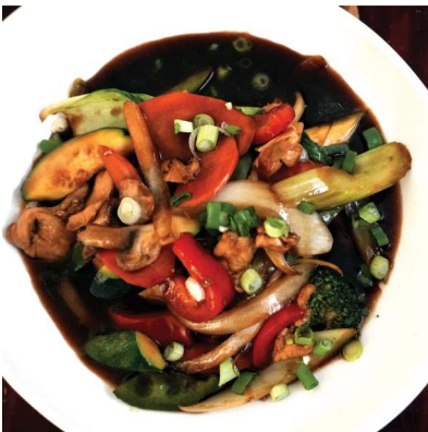
Stir fried Indodesia

(Pick one choice of meat- Fried Tofu, Pork, Chicken, Beef add $2, Shrimp add $3)