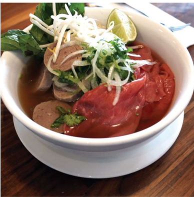
Steak and Meatball Pho