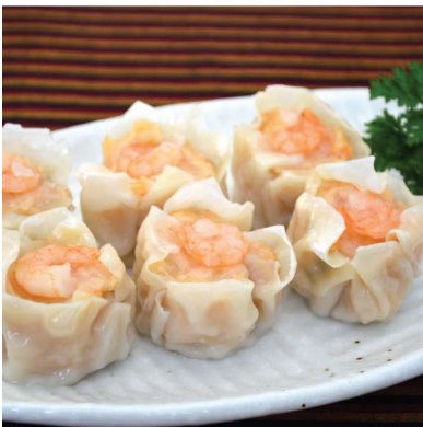
Steam Pork & Shrimp Dumpling (6 pcs)