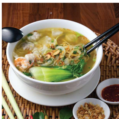
Wonton Egg Noodle Soup