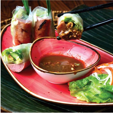
B.B.Q Pork Spring Rolls (2 rolls)