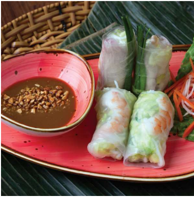
Fresh Spring Rolls (2 rolls)