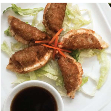
Pot Stickers (5 pcs) Filled with Pork and Vegetables. Steam or Pan Fried