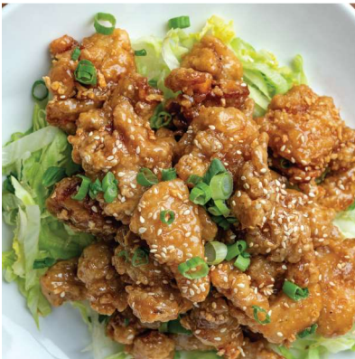
Crispy Garlic Chicken