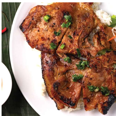
Grilled Porkchop and Rice