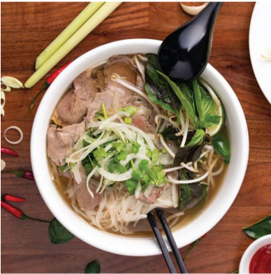
Steak and Brisket Pho