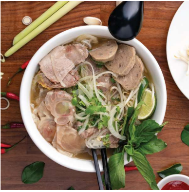
House Special Pho