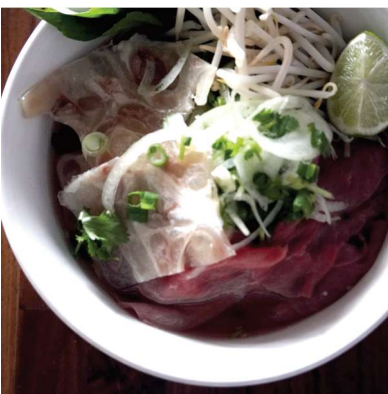
Steak and Tendon Pho