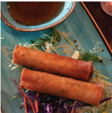
Egg Rolls (2 rolls)