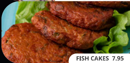
FISH CAKES 7.95