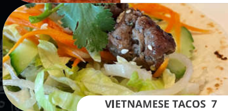
VIETNAMESE TACOS 7