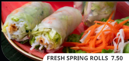
FRESH SPRING ROLLS 7.50