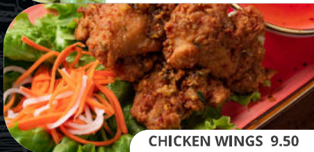
CHICKEN WINGS 9.50