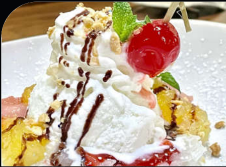
SWEET STICKY RICE WITH ICE CREAM 10.00

Sweet mango with sweet sticky rice topped with coconut milk and sesame seeds.