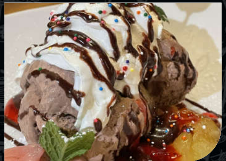
ICE CREAM (VANILLA OR CHOCOLATE) 5.00

A rich dessert cake made with cream and soft cheese on a graham cracker, cookie, pastry crust and topped with strawberry or pineapple sauce.