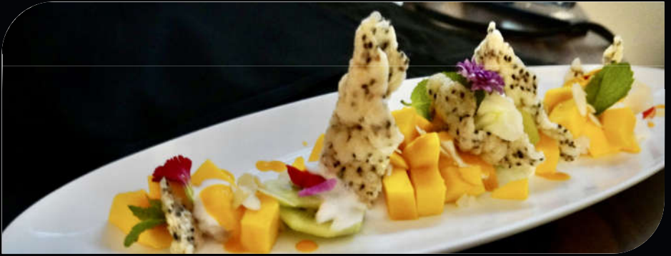
MANGO STICKY RICE (SEASONAL) 12.00

Sweet mango with sweet sticky rice topped with coconut milk and sesame seeds.