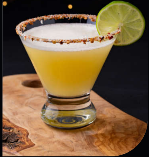
Tamarind Whiskey Sour