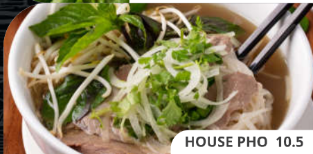
HOUSE PHO 10.5